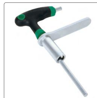
torque adjustment tool (optional)